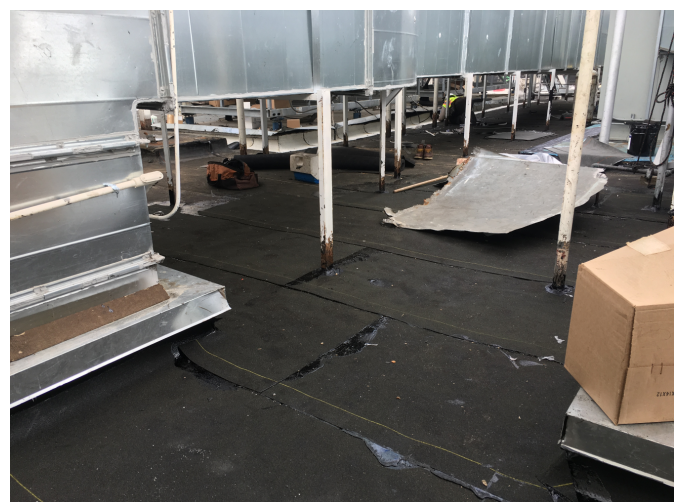
Cap sheet being installed around HVAC platforms.