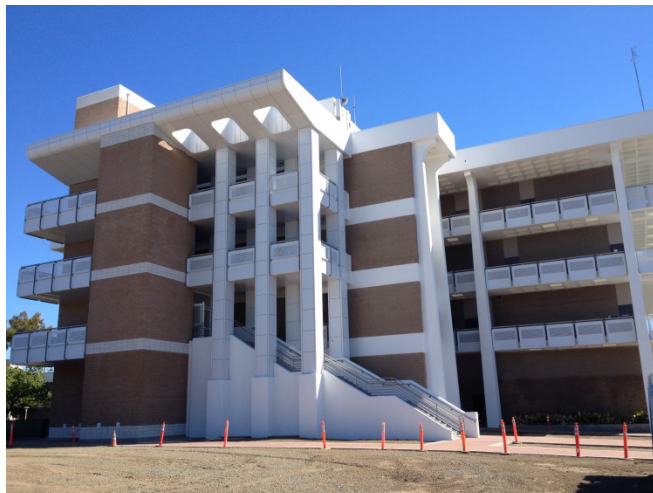
Dunlap Hall with major construction activities completed.