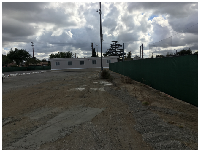
Fencing and contractor office trailers in Parking Lot 9.